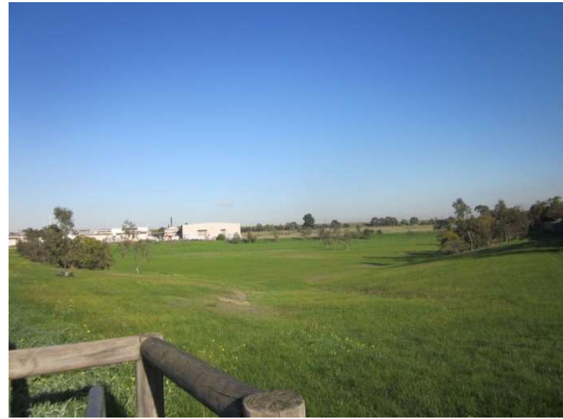
Gilmour Road Retarding Basin looking west