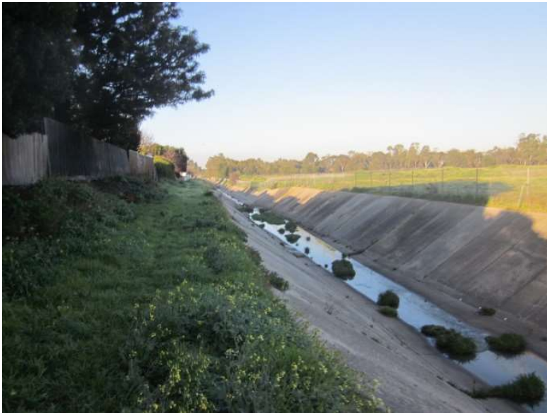
Existing culvert. Furlong Road looking south